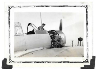
Private Ganther and fellow mechanic work on a training aircraft at Randolph Field in June 1941