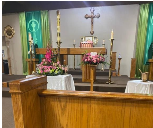
A remembrance of her life took place July 31st 2020 at St. Leonard's Catholic Church