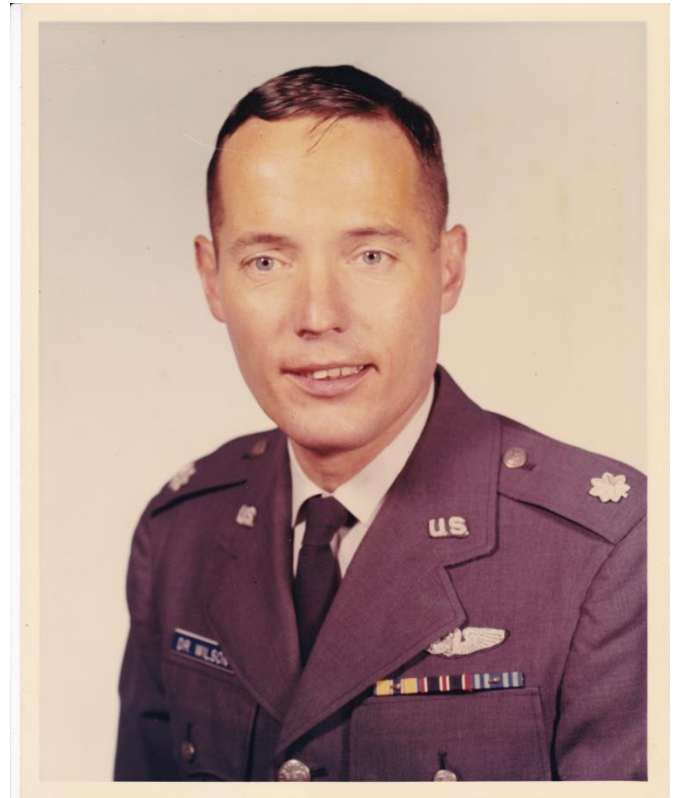
1968 US Air Force Aeromedical Flight on Project Gemini Missions